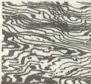
"Did he say a mosaic on N111 707?"

All of our fixed-wing acrfht departed for Anchorage between the 15th & 20th of Apr - 6 L-20's and 6 L-19's all told... It was a fine extended Cross-Country with only one minor mishap - a snapped rudder cable. The freighter & troopship weren't far behind and soon Elmendorf AFB was overrun with AA's champing at the bit and pleading to be issued a mosquito net, sleeping bag, and copter and be sent out into the field. Wasn't long before old buddies were separated & shipped out to unpronounceable villages, leaving the hard core of the outfit, Hq & Maint Secs, in the comparatively large town of McGrath, Alaska (pop. 150).