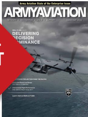
ARMY AVIATION Magazine April/May 2023 Issue