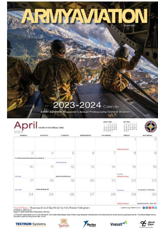
2023-24 Photo Contest Calendar