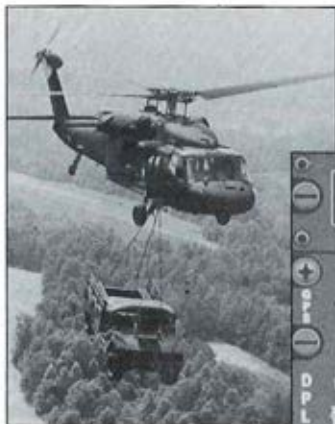
AN/ASN-128B Doppler/GPS Navigation Set 2 Line Display