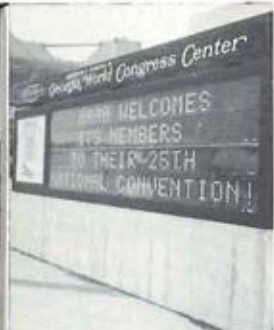
The Ga. World Congress Center sign reads: "AAA welcomes its members to their 25th National Convention"