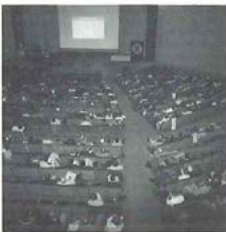
The posh 1,200-seat auditorium at the Georgia World Congress Center was the site for both Friday and Saturday professional programming.