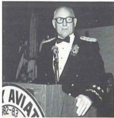
Lt. Gen. La Vern E. Weber, DCG, Mobilization Planning, USA FORSCOM, introducing the representatives of the "Outstanding Reserve Component Aviation Unit."

As a reminder to Quad-A, 60% of the aircraft in the Forces Command are found in the Reserve Components.