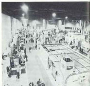
An overhead view of Exhibit Hall C at the Georgia World Congress Center depicts a part of the 20,000 square feet of aerospace and military displays seen at AAA-Atlanta.