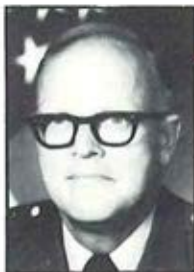
MG Emil L. Konopnicki Commander, USA TSARCOM (DRSTS-G) 263-2201