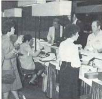
National Office staffers, backed by Atlanta Convention Bureau contract personnel, kept the registration lines short throughout the course of the four-day Atlanta convention.