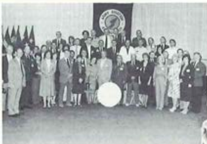
One of twelve AAA Chapter group photographs that will appear in the June-July issue of "Army Aviation" next month. This Teeny Weeny shows 48 of the Army Aviation Center Chapter members who were on time.