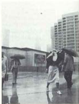
Everything at AAA-Atlanta didn't come up roses. The hotel and the Congress Center were connected by an open bridge and, yes, it rained!