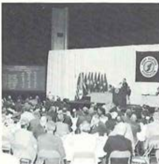
Some 70 senior military attendees and an equal number of senior executives representing AAAA's Industry Member firms attended the AAAA's very first "First Light Breakfast".

The three-day AAAA professional program featured some 16 military speakers and six industry executives