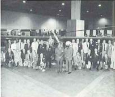
35 members of AAA's own splinter group, the organization of World War II Army Liaison Pilots known as the "Cub Club", gather under an Army L-4's wings prior to their annual elbow-bending.