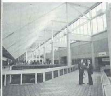
The attractive, but cavernous Georgia World Congress Center (Note two members in the foreground) provided the AAA with sufficient meeting room and exhibit hall facilities.