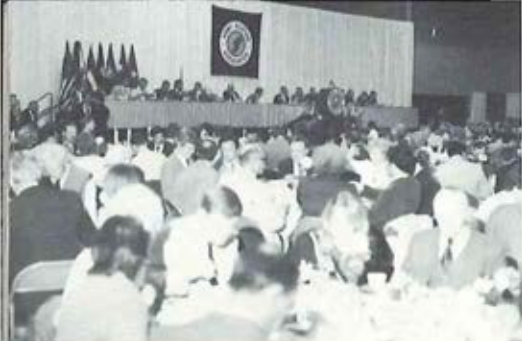
The record-breaking Membership Luncheon audience of 613 AAAA members and spouses and the day's head table of ten National and Chapter award recipients are shown at the Georgia World Congress Center luncheon.