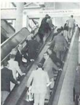
There was a constant "up-down" flow of attendees from the professional sessions to the Exhibit Hall refreshment breaks and back again