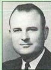
VP, NATIONAL FUNCTIONS A.D. High