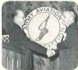
AAAA AWARDS Pages 8 and 9