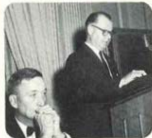
BUSINESS SESSIONS Pages 7 through 39