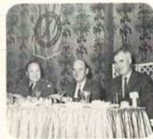
DELEGATES' LUNCHEON Page 40