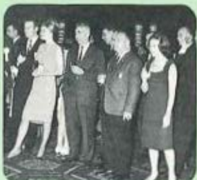
The box having been uncrated, attendees watch scene (below):