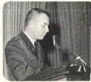
FILM PRESENTATIONS Page 15