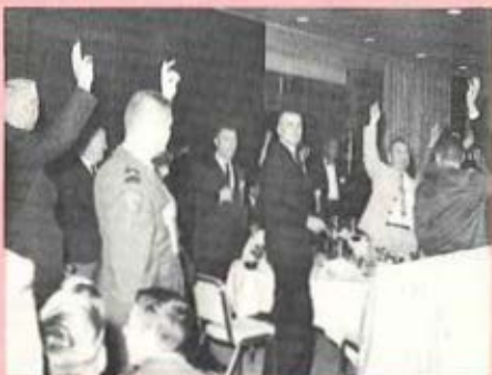
The end result! . . . The Delegates reject a dues increase in an informal ballot.