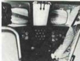
FLIGHT SIMULATOR: Tomorrow's flying today is a reality for Sikorsky engineers and test pilots, thanks to this flight simulator for studying a wide variety of vertical and short take-off and landing (V/STOL) aircraft. Laboratory facilities unmatched in the V/STOL field help support Sikorsky's intensive program of advanced research.