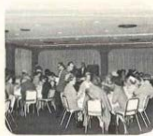
LADIES' LUNCHEON Pages 32 and 33