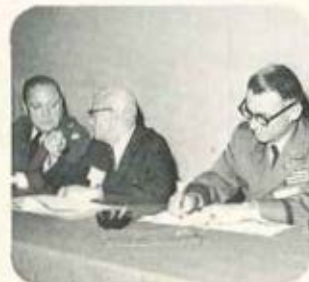
NATIONAL ELECTIONS Page 19