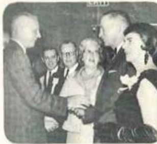
PRESIDENT'S RECEPTION Page 43