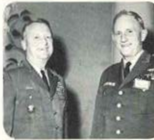
AAAA RECEPTION Page 44