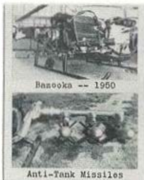
Banzooka -- 1950