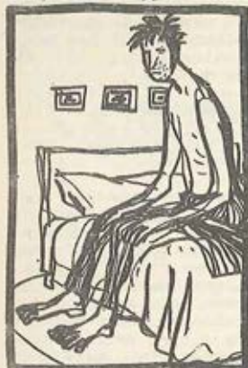
Sometimes the Earlybird doesn't want the worm!